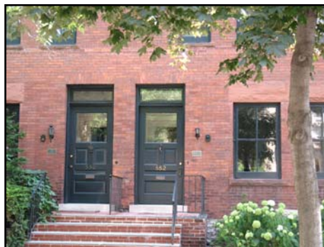
552 Portland Avenue