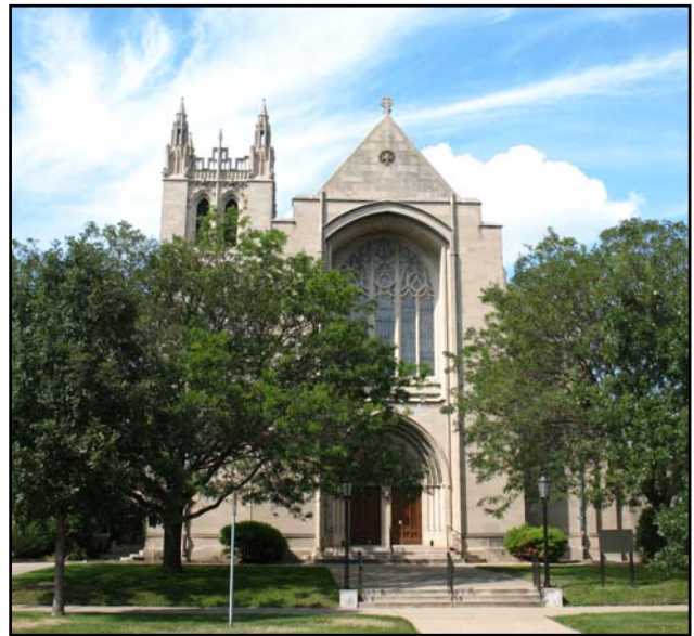
House of Hope Presbyterian Church