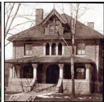
Freeman House at 505 Summit Avenue Minnesota Historical Society Collections