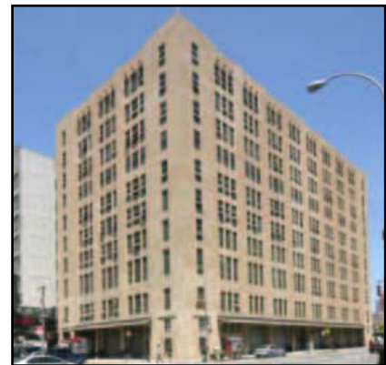
R. C. Williams Company Warehouse New York City Landmarks Preservation Commission

Austin, Nichols and Company Warehouse, both in Brooklyn. The location was chosen in part in anticipation of the elevated and electrified freight line, known as the High Line (opened 1933), that would serve warehouses along the west side of Manhattan.