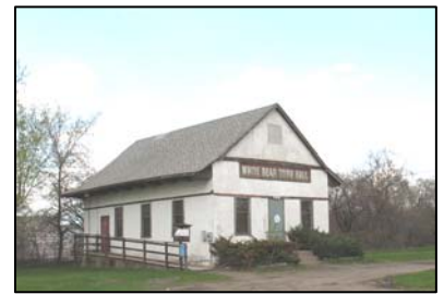
White Bear Lake Town Hall, 2011

The White Bear Lake Town Hall , commissioned in 1885 and designed by Cass Gilbert, served as the meeting place for the town board for over 125 years. Threatened with demolition in part because of its location near Highway 61, the building has been moved to a new location in Polar Lakes Park with the aid of the White Bear Lake Historical Society and White Bear Lake Township. This is the fourth location for the building; it was moved on November 21, 2015. The goal is to preserve the building and restore and renovate it as a functional, aesthetically appealing building for a variety of community programs.